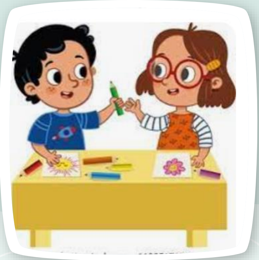
Sharing toys and interacting in play with others