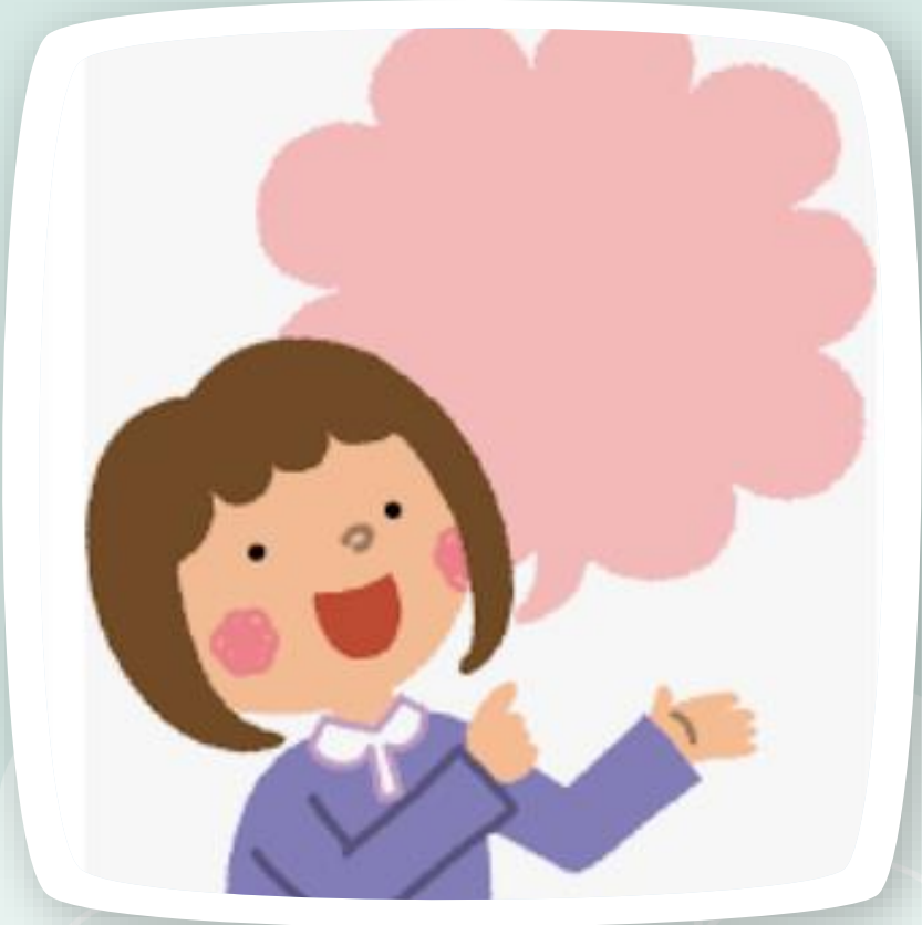
Using full sentences in conversations, for example, please can I have ...