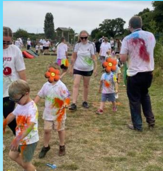
Parents/carers, children and staff having fun at the Nursery Colour Run this week